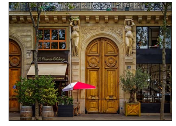
Eg: Perfect for the main entrance of a building.

DINRTT is a 2 relay remote control unit that can work a sensitive push button. Flush mount.