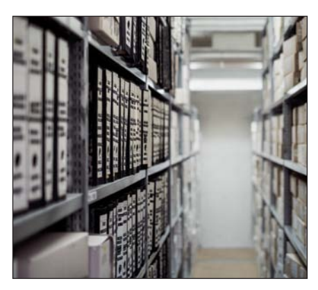
Eg: ideal for a store room in a shop or office.

RTT is a 1 relay remote control unit with that can work as sensitive push button. Surface mount.