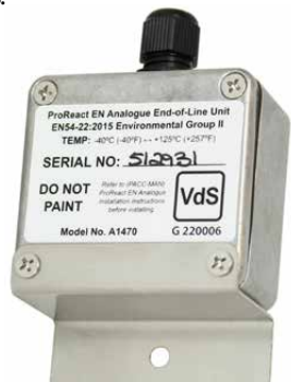
ProReact EN Analogue End-of-line Unit

The ProReact EN Analogue End-of-line Unit is compulsory in all ProReact EN Analogue LHD systems as it has a key role in the operation of the technology, allowing the control unit to detect a short circuit or open circuit in the sensor cable. It is small in size and is straightforward to be mounted on surfaces.