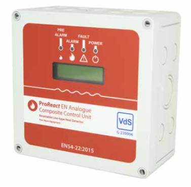
ProReact EN Analogue Composite Control Unit

More information relating to Thermocable's ProReact EN Analogue Composite Control Unit can be found in the product datasheet or installation manual, both of which are available on request.